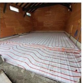
Utilization of residual fibre for district heating in rural British Columbia.